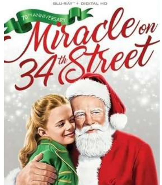
Miracle on 34th Street Dec 22 6pm Community Room