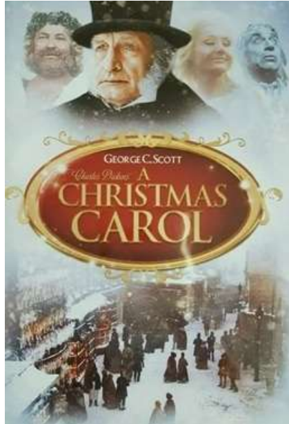
A Christmas Carol Dec 14th 4pm Community Room