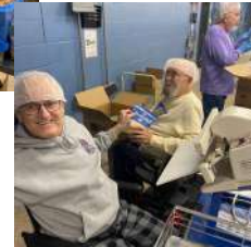
Feed My Starving Children