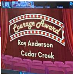
Corporate Year End Awards